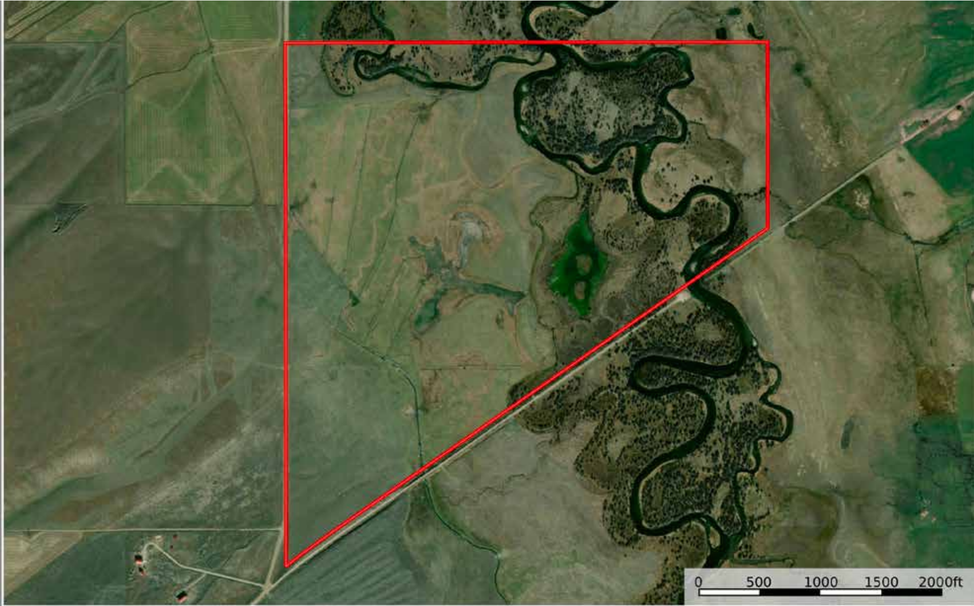
Sundown Ranch - Aerial Map

••Maps are for visual aid only, accuracy is not guaranteed.