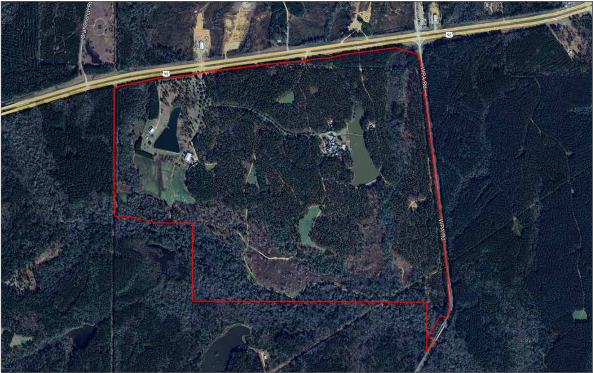
Black Creek Farm - Aerial Map

••Maps are for visual aid only, accuracy is not guaranteed.