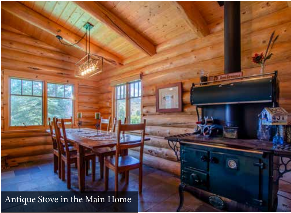
Antique Stove in the Main Home