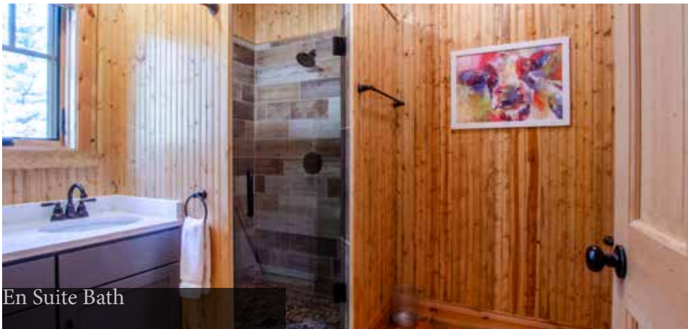
En Suite Bath