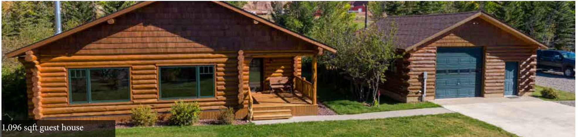
1,096 sqft guest house