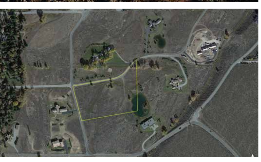
** This is an exclusive listing of Live Water Properties LLC; an agent of Live Water Properties must be present to conduct a showing. The owners respectfully request that other agents and/or prospective buyers contact Live Water Properties in advance to schedule a proper showing and do not attempt to tour or trespass the property on their own. Thank you.