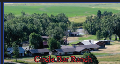
Circle Bar Ranch

3473+/- ac. total. 1855 ac in CRP w/ payments of $44,675 with new 10 year contract. CRP is separate from grazing which generates another $5,000/yr. Beautiful area and nice ranch. $1,295,000