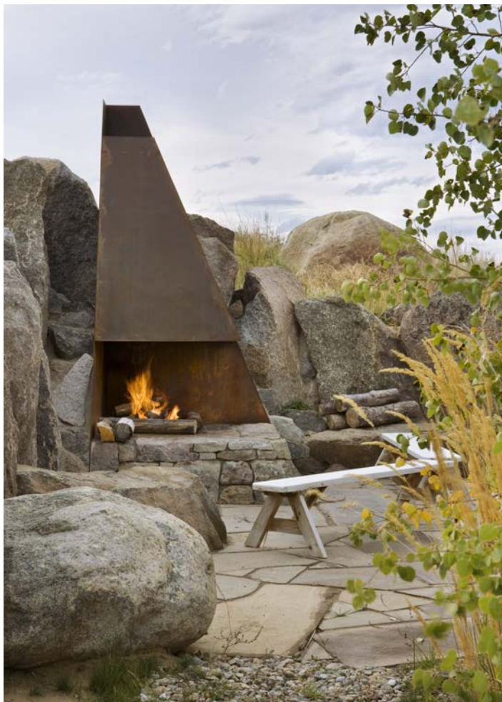
Opposite page: The Ranch Manager's home sits just below the main house. Above: There are outdoor spaces to congregate at throughout the ranch.