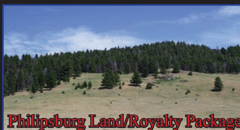
Philipsburg Land/Royalty Package