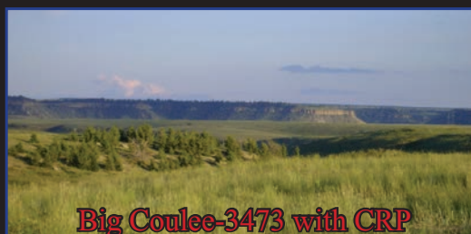
Big Coulee-3473 with CRP

640+/- ac. just 2 mi north of P-Burg WITH private royalty interest with an average cash income of $66,343 over the past 5 years. Excellent potential development property. Inflation buster! $1,436,000